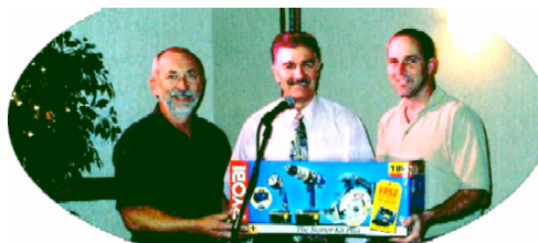
Beside the "Welcome to Conference" gifts - we reward our attendees with many raffles through out the event!