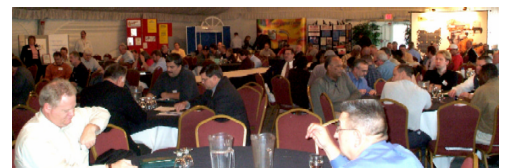
Attendees and Exhibitors are serving lunch together getting to know each other better!