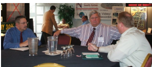
Questions and Answers - Table Talk sessions